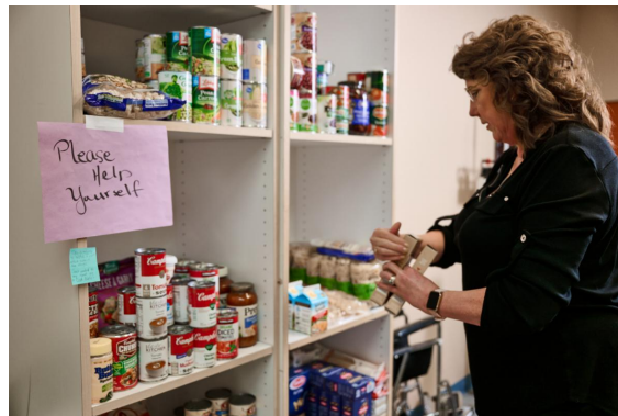
Sequim Free Clinic