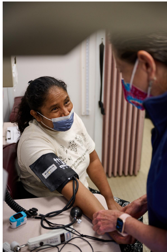
Lahai Health

Battle Ground HealthCare, CarePoint Clinic, Caring Hands Worldwide, Children's International Health Relief, Consejo Counseling and Referral Service, Free Clinic of SW Washington, Grace Clinic, Health and Hope Free Clinic, Hope Care Clinic, Lahai Health, MercyWatch, New Hope Health Center, Olympic Peninsula Community Clinic, Pierce County Medical Reserve Corps Clinic, Safe Harbor Free Clinic, Seattle/King County Clinic, Sequim Free Clinic, Snake River Community Clinic, SOS Health Services of Walla Walla, The Olympia Free Clinic, Trinity Neighborhood Clinic, Union Gospel Mission Inland Northwest, Washington State Department of Health, Yakima Union Gospel Mission Medical Care Center