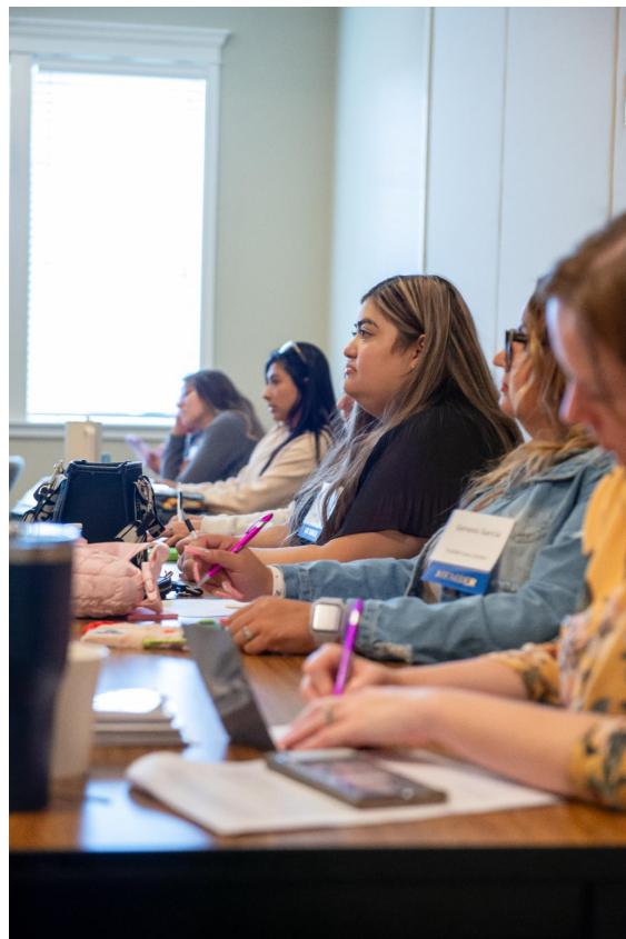
2024 Washington Free and Charitable Care Conference